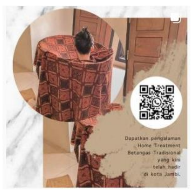
Photo 2 . Home Treatment adopted the concept of the Betangas tradition in a spa business in Jambi City

with this traditional herb can balance the body and soul. This is because heated leaves can produce disease-causing agents (Dumatubun, 2002, p. 6).