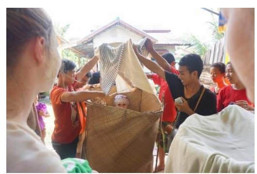
Photo 1. People who get into traditional steam bath pandan leaf mats

The second is the implementation stage. This stage is done with water that is put in a pan that is ready to be heated over medium heat. After the water boils, add the spices to the boiling water. The pot that contains all the spices needs to be covered. This is done so that not a lot of steam evaporates to the outside. The steam is still maintained to expel sweat. Next, after the boiled water that has absorbed the essence of the spices from the spices is ready, the container is moved next to the bride-to-be, who will sit on a small chair. Then, the mats are arranged around the position of the prospective bride, who is sitting next to the boiled water of spices. The roll mats are covered with layers of cloth so that the steam from the cooking water does not escape from the area of the mat rolls. The lid of the container containing the spice water is then opened to allow the steam to escape from the container. After that, the shaman recites a mantra which is nothing but a prayer to read the holy verses of the Qur'an, sequentially, namely Surah Al-Ikhlas three times, reading Surah Al Alaq three times, and finally reading Surah An-Nas three times. This steam bath is done for twenty minutes. Furthermore, after the time is up, the role of mats can be opened. The opening of the roll of mats indicates that the steam bath ritual has been completed.