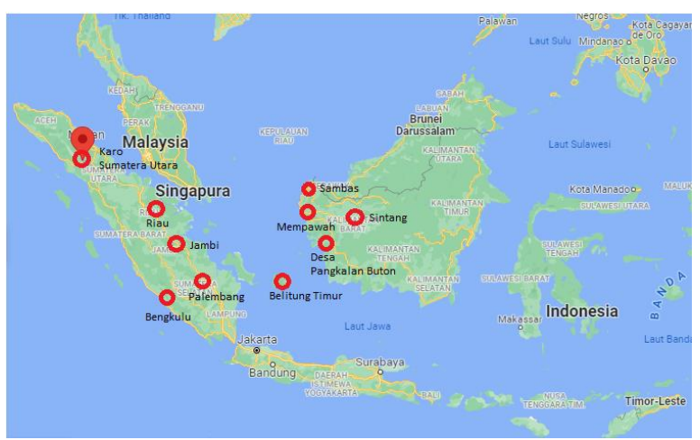
Picture 2. Location of the distribution of areas that are still using steam baths as a tradition in Indonesia

The diversity of plants used for traditional steam baths in the ten areas is dominated by various types of spice plants. Steam bath or Oukup in North Sumatra, for example, there is ginger and essential oils which are used as spices which are included with other plants. In Tanjung Bajo Village, Betangas steam baths use betel leaves and bay leaves as spices that complement other ingredients. In Palembang, the spice used is candlenut. In Mempawah Regency (Pontianak), the ingredients used are citronella, turmeric leaves, and galangal leaves. In Sintang Regency (West Kalimantan), lemongrass, cardamom, and cinnamon are used as spices. Furthermore, in Sambas Regency, there are citronella, cloves, fennel, and cinnamon. In Pangkalan Buton Village, North Kayong, there are spice plants in the form of lemongrass, cardamom, cinnamon, and anise. Finally, in East Balitung there are spice plants in the form of turmeric, cinnamon, and citronella. Only two areas where the steam bath is not accompanied by spices, namely Bengkulu and Riau.